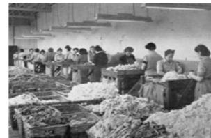
We recycled textile waste for resale and eventually used it to make our own carpet tiles

With the advent of synthetic fibres, we quickly adapted to also recycle synthetic waste, eventually focusing solely on the recycling of nylon and polypropylene. With the development of a new type of carpet, needlefelt (now called fibre bonded), we saw an opportunity to use this recycled material to produce our own finished products.