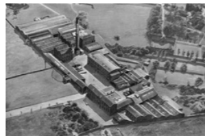
Established in 1917 as J&F Burrows, in West Yorkshire, UK

Originally established in the UK in 1917 as J&F Burrows, we have been recycling for over 100 years. We began by recycling wool and cotton textile waste for resale to the textile industry, for use in the manufacturer of clothing.